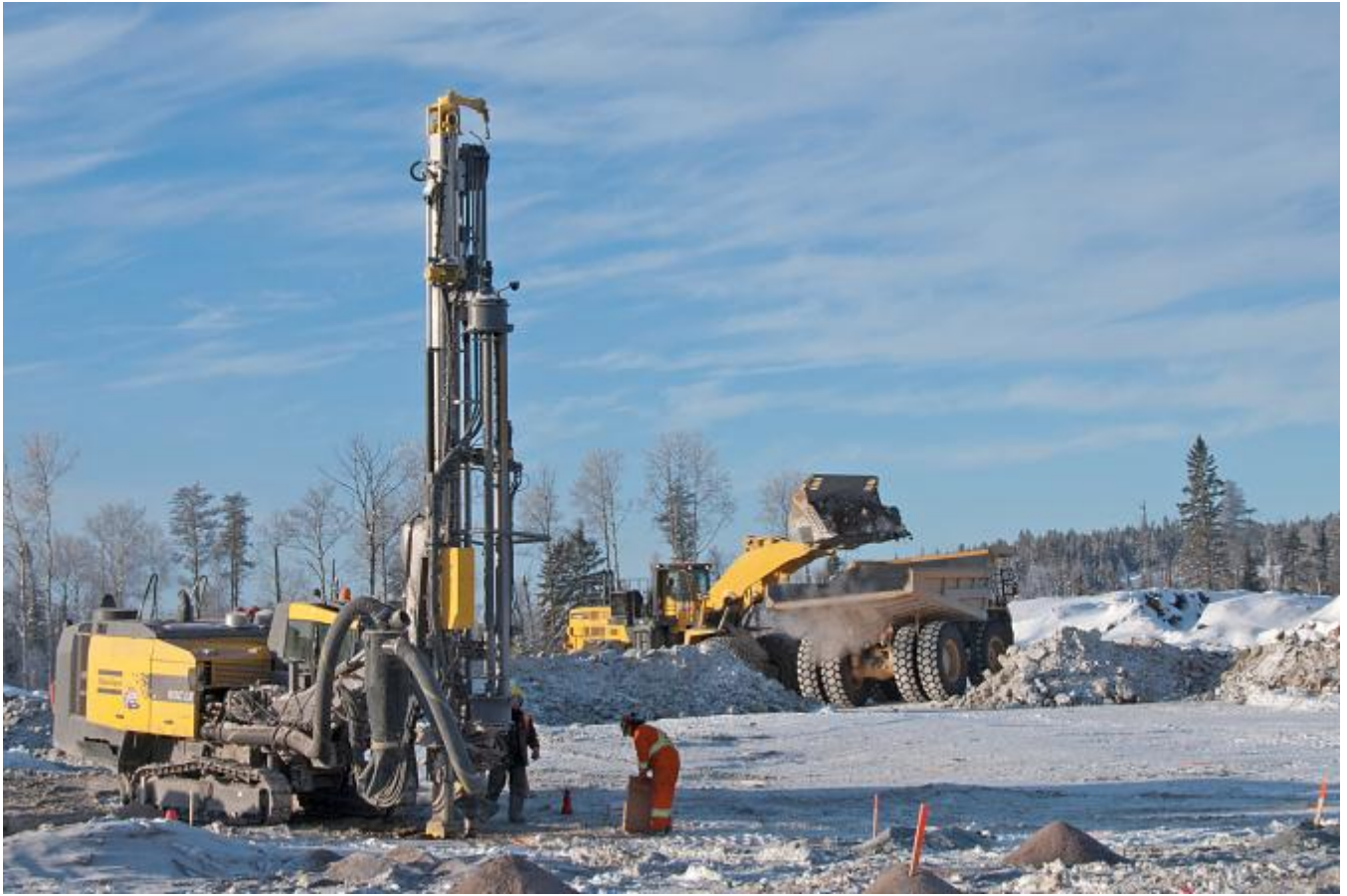
Figure 5: Open pit production drill