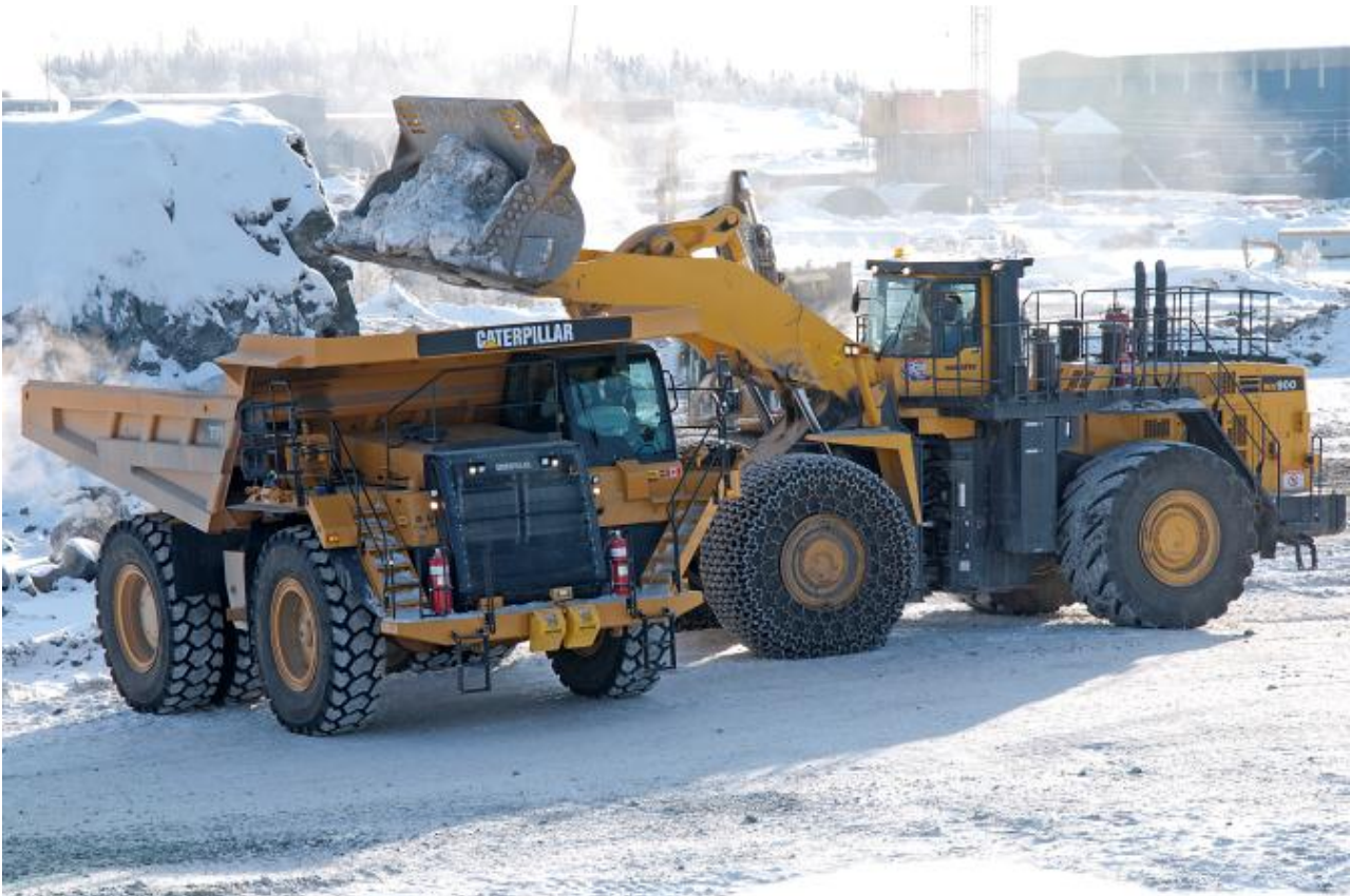
Figure 4: Open pit operations