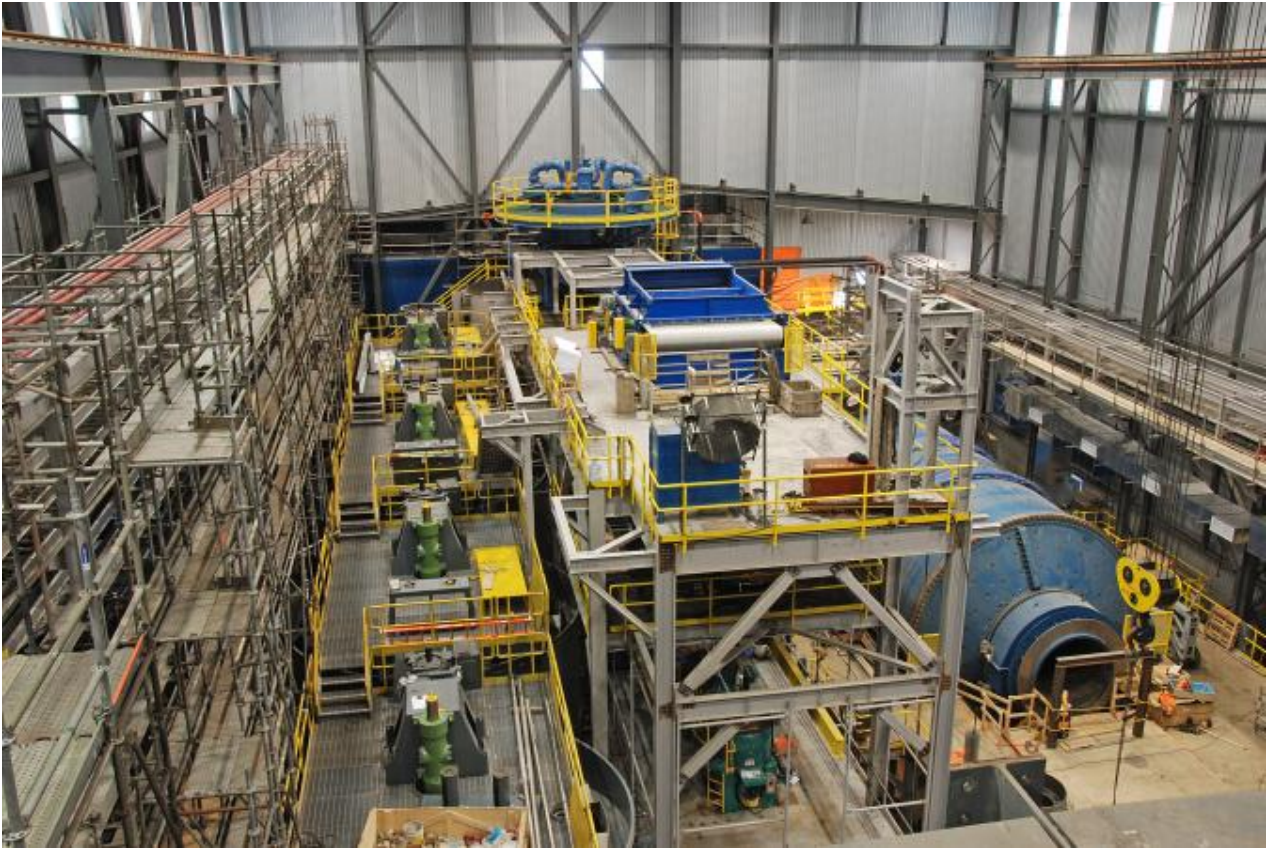
Figure 3: Mill interior