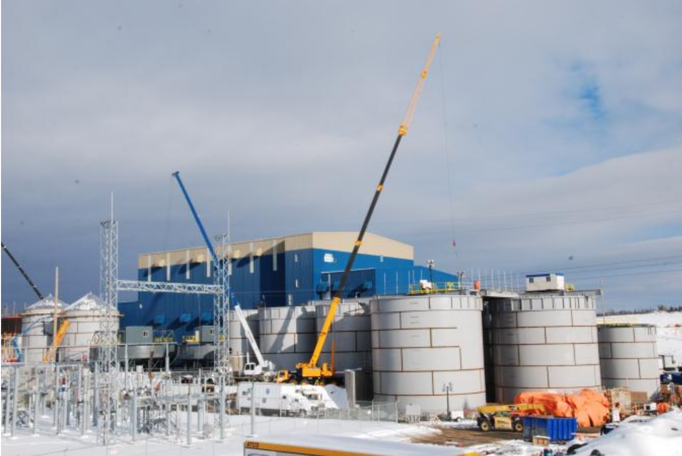
Figure 2: Mill exterior