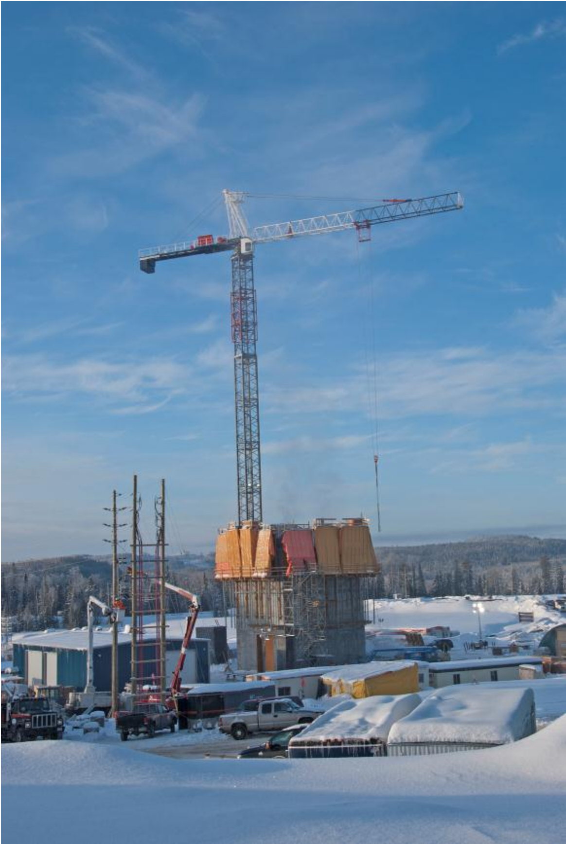
Figure 6: Headframe construction for Northgate shaft